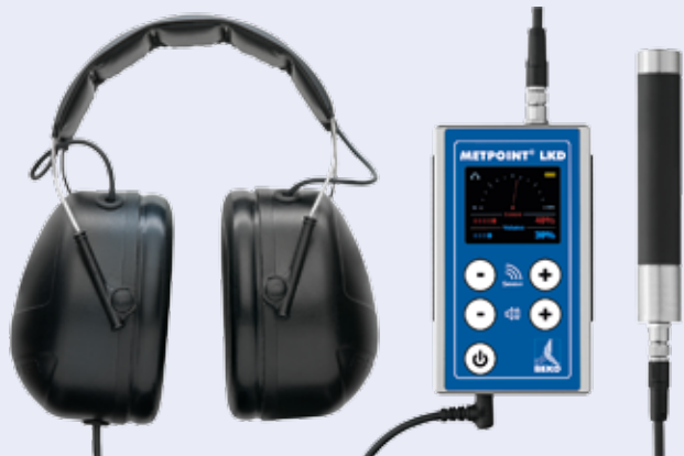
Product examples from the scope of delivery. Not type-binding.

The METPOINT® LKD detects the ultrasound, transforms it into an audible sound and indicates it optically. The METPOINT® LKD operates with extreme reliability. As only those frequencies are detected which occur in the event of leakage, precise location of the leaks is ensured under all types of industrial noise conditions.