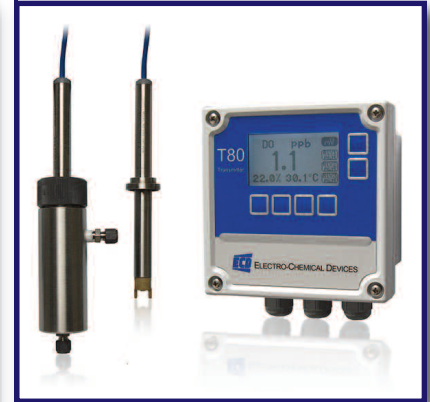
Model DO90 ppb Dissolved Oxygen