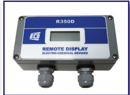
Model R350D 4-20 mA Remote Display