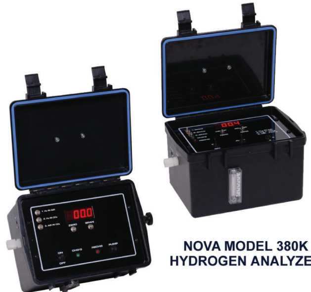
NOVA MODEL 380K HYDROGEN ANALYZER